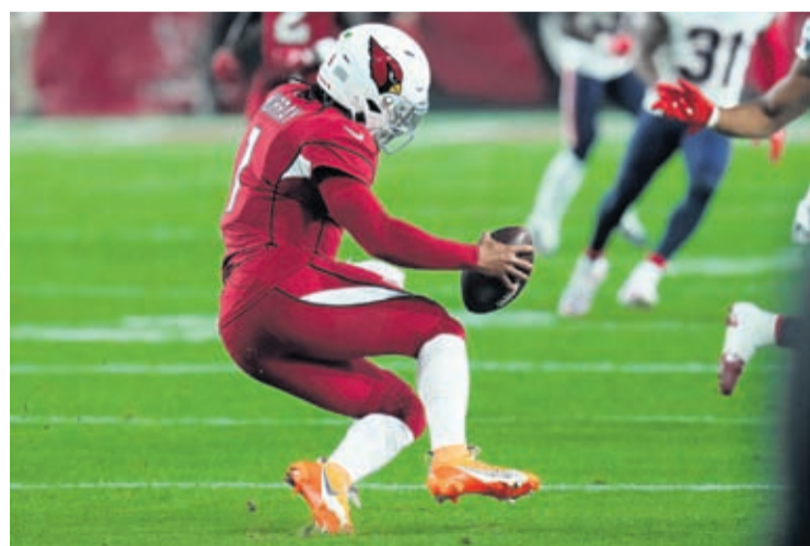
Arizona Cardinals quarterback Kyler Murray (1) falls to the ground due to an injury during the first half of an NFL football game against the New England Patriots, Monday, Dec. 12, 2022, in Glendale, Ariz.